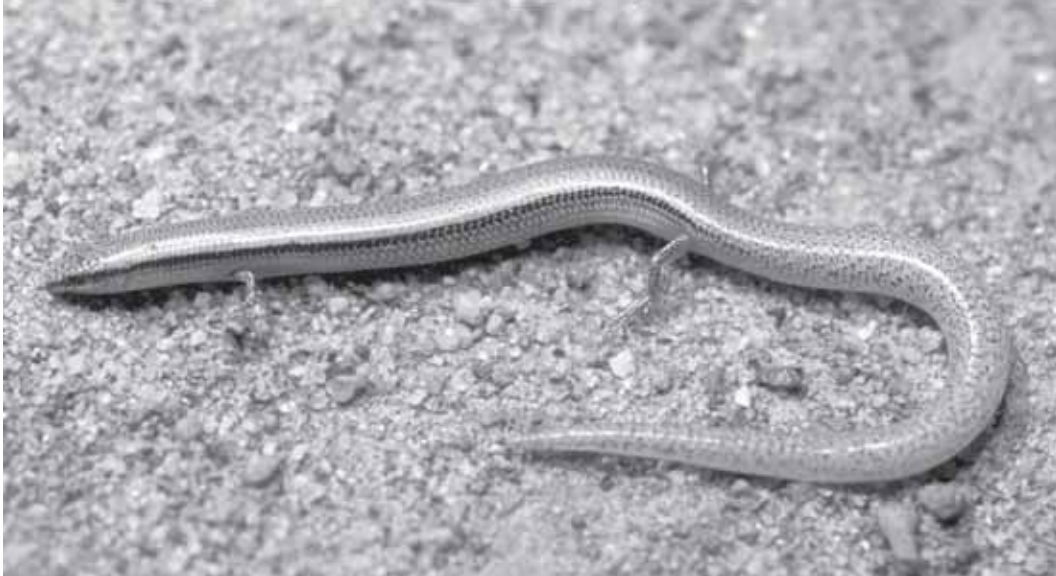
FIG. 1. One of the paratypes of Lerista chordae in life, Torrens Creek-Aramac Rd (21°05'30"S 145°00'16"E).

(3rd) 9-12 (mean=10.11, SD=0.93, n=9); subcaudals 78-81 (mean=79.33, SD=1.53, n=3).